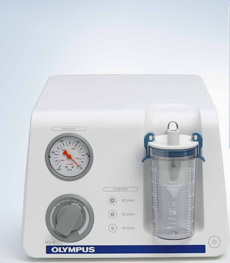
KV-6 Medical Virus Filters