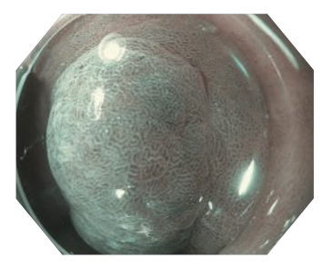
NBI image