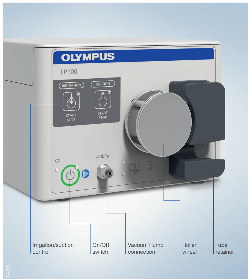
Front view of the pump

The laparoscopic pump complies with CE regulatory requirements.