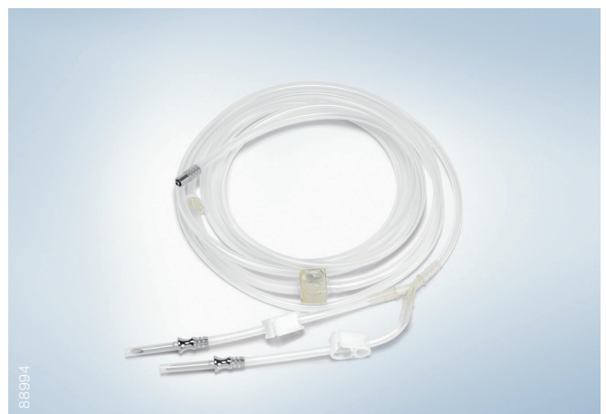
Tube set for irrigation, reusable