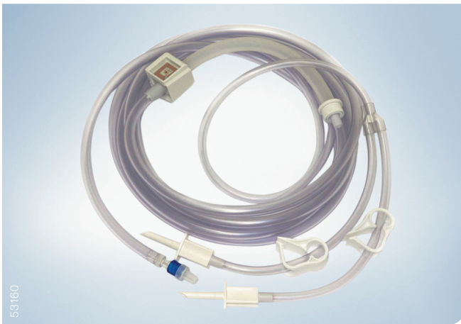
Tube set for irrigation