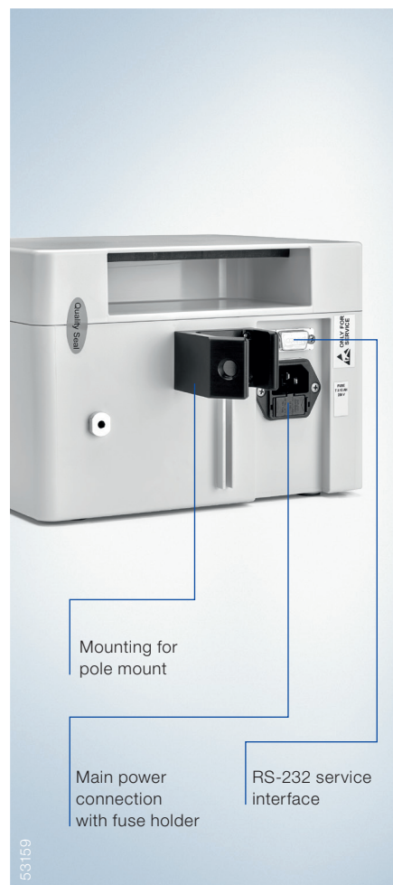
Rear view of the pump