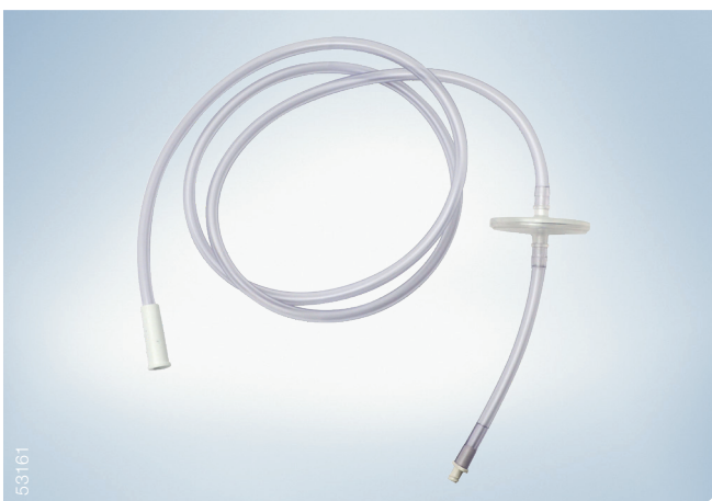
Vacuum tube set, incl. filter